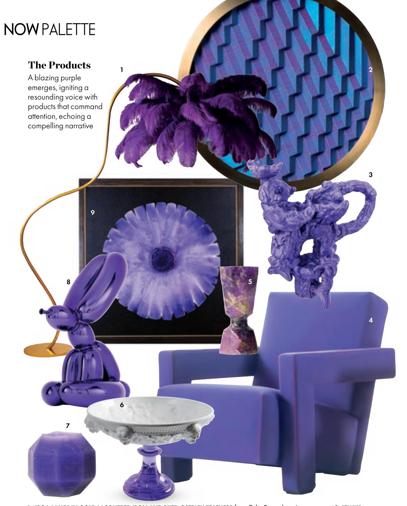
1. "BOA LAMP" IN GOLD LACQUERED IRON AND DYED OSTRICH FEATHERS from Culto Ponsoda, price on request 2. "FLUX" A ROTATING ARTWORK IN RAW SILK AND ANTIQUE BRASS part of Transition collection by Orikrit, ₹2,40,000 3. SCULPTURE METABOWL 11 3D PRINTED designed by Audrey Large for Nilufar 4. "UTRECHT" AN ARMCHAIR designed by Gerrit Thomas Rietveld for Cassina, available at Etreluxe, both prices on request 5. "AMETO PEG MEASURE" AMARANTHINE BARWARE by Ayush Kasliwal for Ikai Asai, ₹14,600 6. CRYSTAL TABLETOP CENTREPIECE by Le Porcellane, available at Maison Sia 7. "ROMBI" AROMATIC AND COLOURFUL VASE from hugi.r Design studio 8. "BALLOON RABBIT" HIGHLY REFLECTIVE VIOLET PORCELAIN designed by Jeff Koons for Bernardaud, all prices on request 9. "COSMIC FLOWER" AN ACRYLIC PAINTING by Rajesh K. Baderia for Masha Art, available at Tata Cliq Luxury, ₹4,48,000 For details, see Address Book